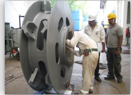
New Gypsy Wheel