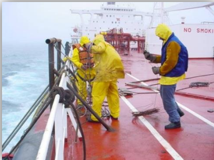
Riding Crew on Voyage Repair