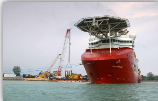
Repair Alongside Singatag Wharf