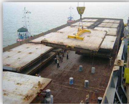
Hatch Cover Repair