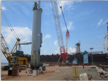
Deck Crane Repair