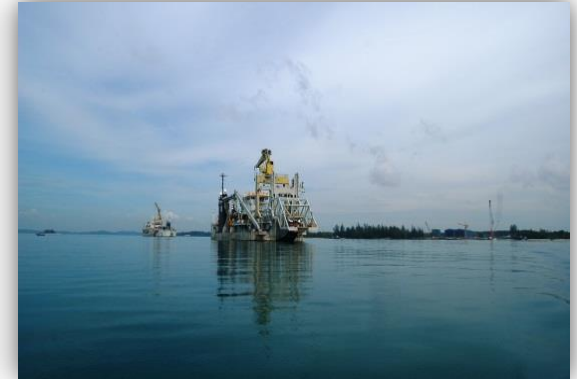
Repair of Dredgers at Bintan IPL