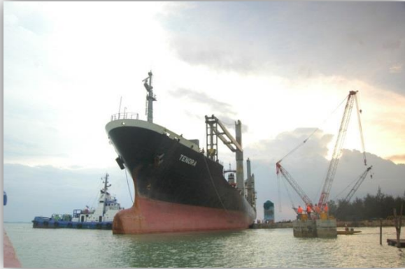
Deck Crane Repair Alongside Singatag Wharf