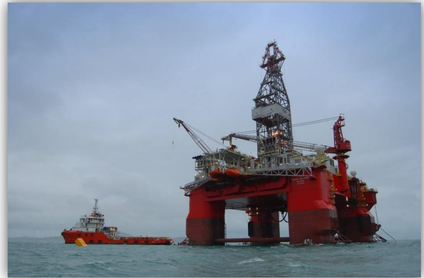
Repair at Bintan IPL