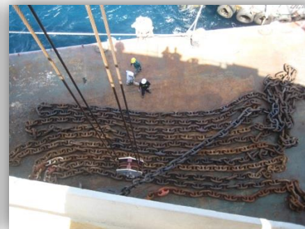
Chain cleaning at OPL