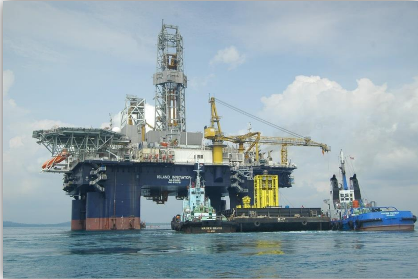
Repair at Bintan IPL