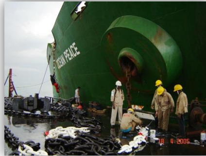
Anchor & Chain Renewal