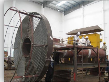
New Crane Column