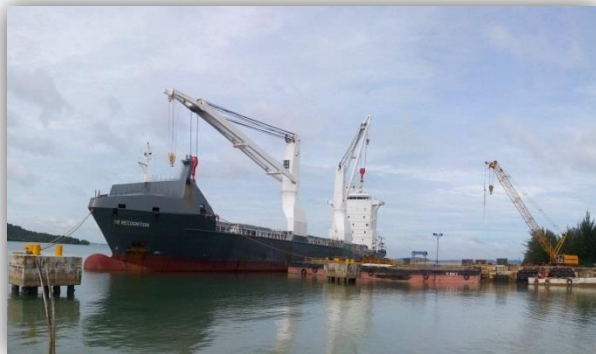
Repair Alongside Singatag Wharf