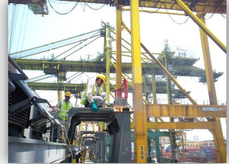
Container Sockets Renewal