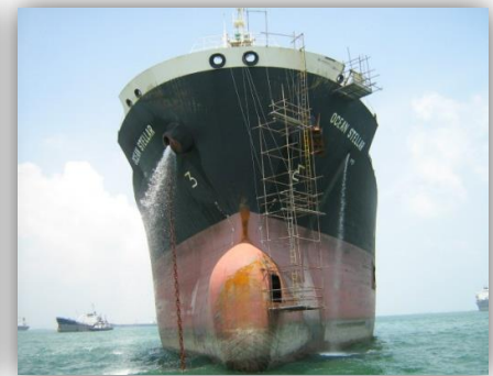
Bow Damage Repair