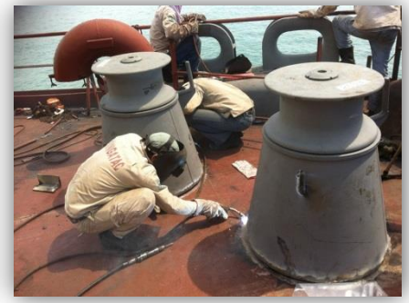
Installation of Mooring Arrangement