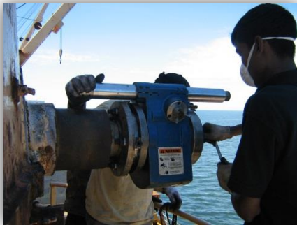
In-Situ Crane Heel Pin Repair