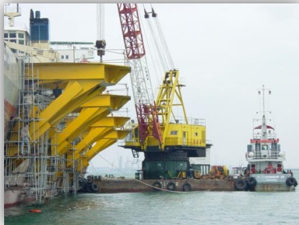
Installation of Outriggers