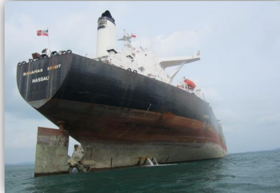
Propeller Repair at Bintan IPL