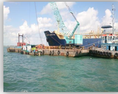
Recovery of Lost Anchor Chain