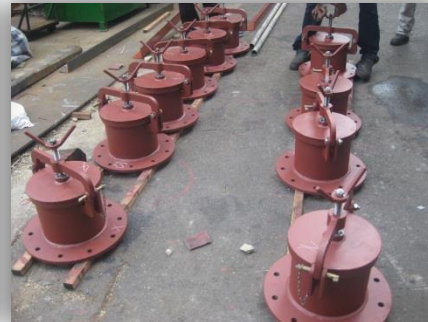
New Sighting Ports