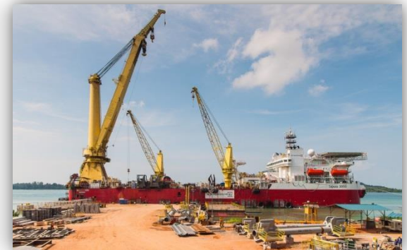
Repair Alongside Singatag Wharf