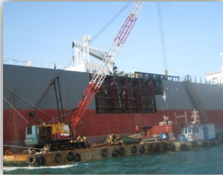
Side Shell Renewal