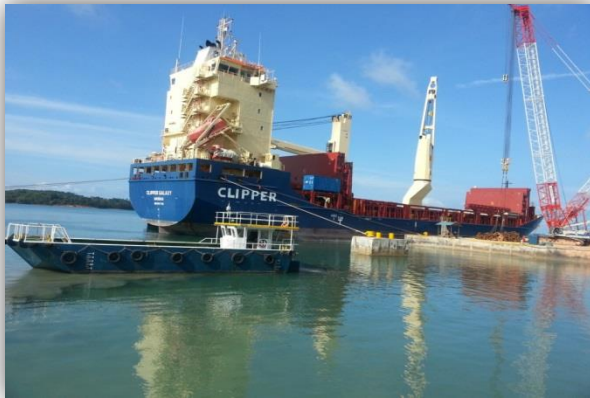
Alongside Singatac Wharf