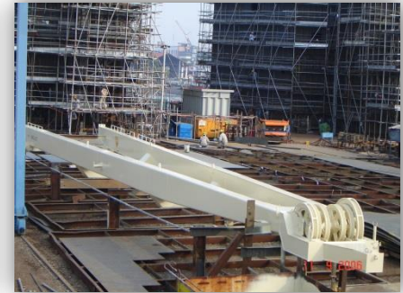
New Crane Jib