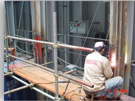
Cell Guide Repair