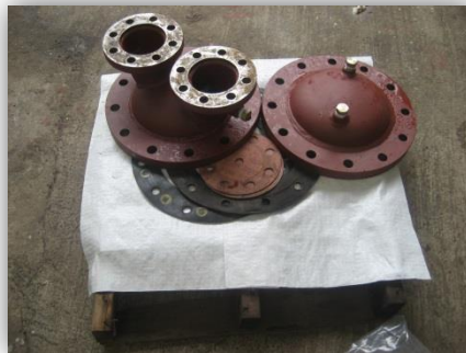
New End Covers