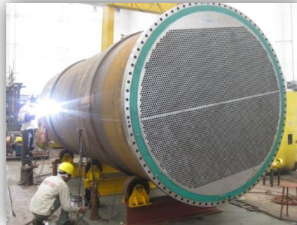
New Boiler Shell