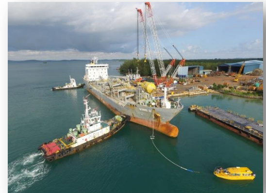
Alongside Singatac Wharf