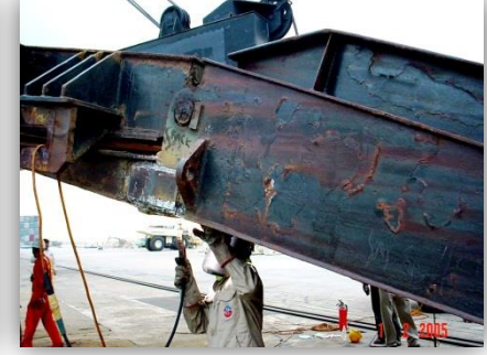
Car Carrier Ramp door Repair